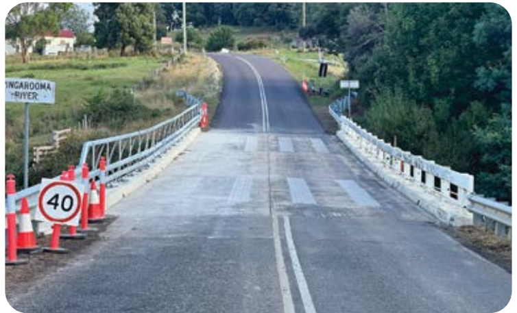
Taken during construction, this image shows the new DOLRE barrier on the left, and the old concrete post and rail barrier on the right-hand side of the bridge deck prior to its removal and replacement.

The off-structure barriers include DOLRE's purpose-designed TL4 rated transitions, which connect the DOLRE barrier to a section of TL4 Thrie-Beam barrier. These TL4 Thrie-Beam barriers subsequently transition to TL3 W-beams with TL3 end terminals.