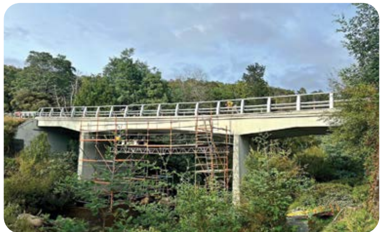
Remediation works on the Ringarooma River bridge near Moorina in north-east Tasmania included bridge strengthening works, application of a new wearing course, and installation of Australia's first DOLRE Regular (TL4) Low Stress Parapet System.